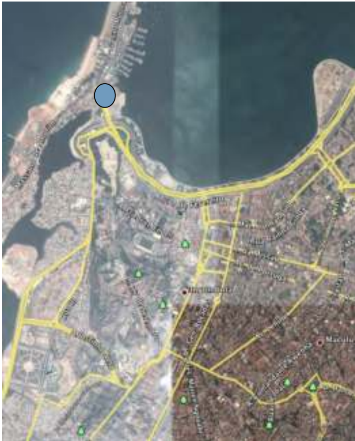
LUANDA BAY WATER FRONT